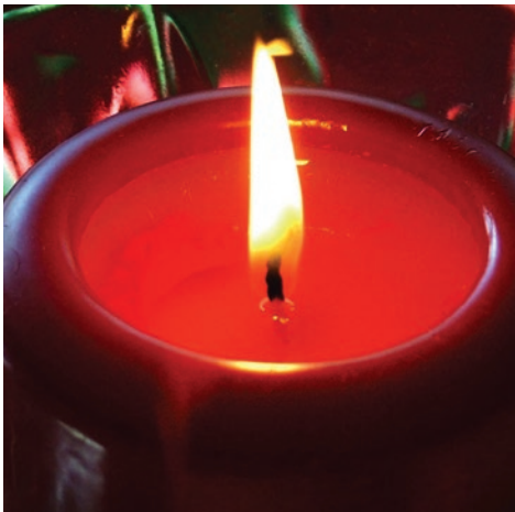
CANDLES/HEATING Pages 8 and 9