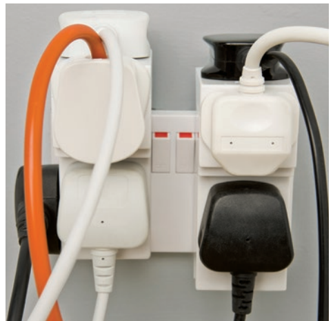
ELECTRICS Page 11