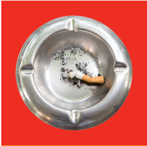
SMOKING Page 3